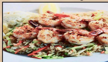
Hawaiian-Style Shrimp Scampi