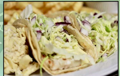
Hana Fish Tacos