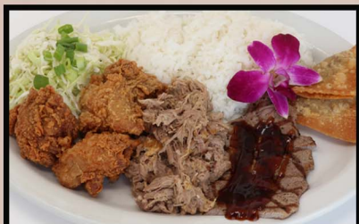
Lahaina Platter #1