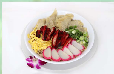
Big Braddah Wonton Min