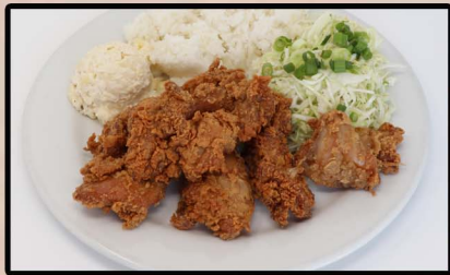
Lahaina Fried Plate