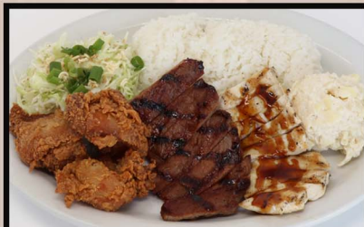
Lahaina Platter #2