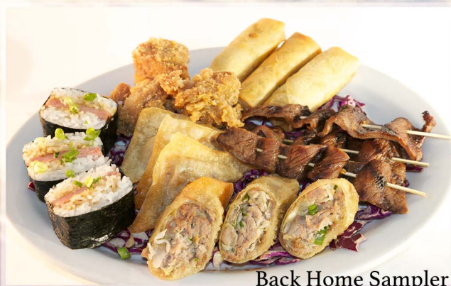
Back Home Sampler

Hawaiian Nachos Wonton chips topped with Portuguese Sausage, jack & cheddar cheese, diced tomatoes and green onions Half order 8.99 Full order 13.49 add HBBQ Chicken 3.49 add HBBQ Beef 4.49