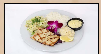
Grilled Mahi Mahi