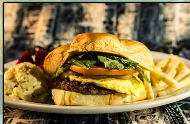
Portuguese Sausage Sliders