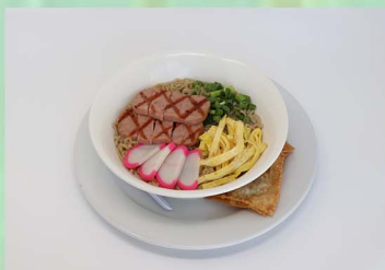
Saimen Noodles with Spam

Chicken Long Rice - Bean thread noodles and chicken breast in a homemade broth Cup 5.99 Meal 11.49 (Meal: large bowl served with rice)