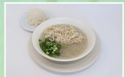
Chicken Long Rice