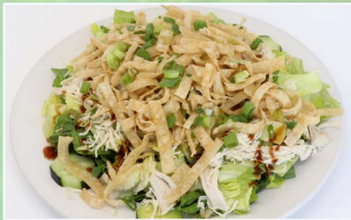
Chinese Chicken Salad

Seared Ahi Tuna Salad - Romaine & iceberg lettuce, tomatoes, carrots, red & white onions, seared ahi tuna, and our spicy mustard dressing. 18.99