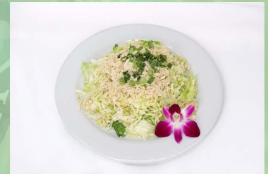
Ramen Cabbage Salad